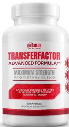
TRANSFER FACTOR CELLULAR IMMUNE SUPPORT