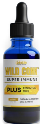
WILD CONK SUPER IMMUNE SUPPORT