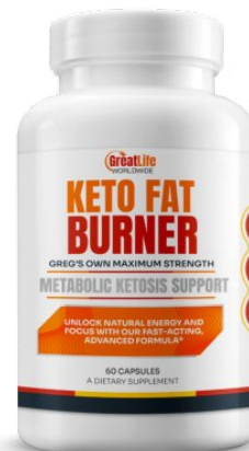
KETO FAT BURNER KETOSIS SUPPORT