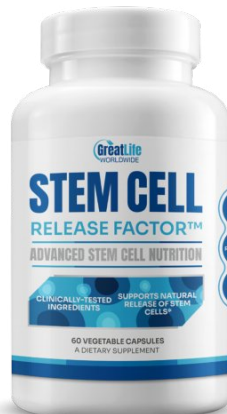
STEM CELL RELEASE FACTOR RENEW AND REPAIR