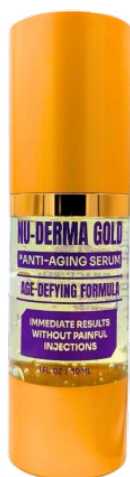
NU-DERMA GOLD ANTI-AGING SERUM