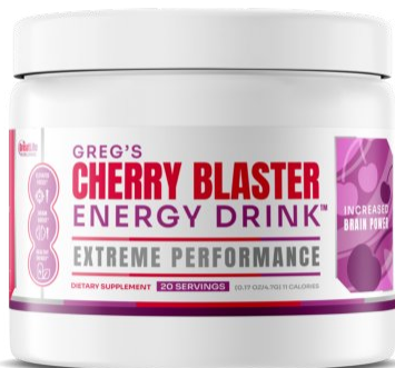
CHERRY BLASTER ENHANCED ENERGY PERFORMANCE