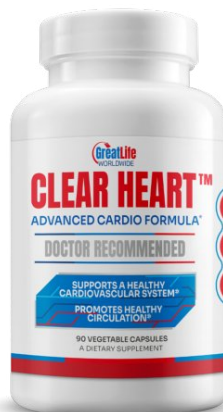
CLEAR HEART CARDIOVASCULAR SUPPORT