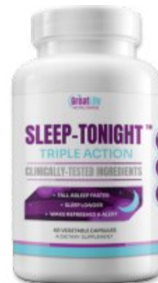
SLEEP - TONIGHT NATURAL SLEEP SUPPORT